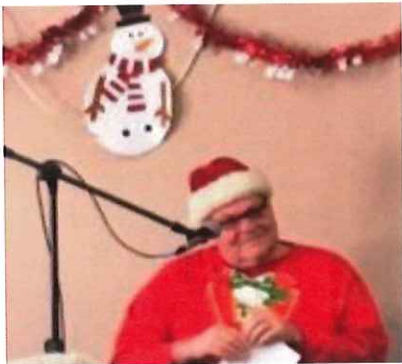
Musical entertainment was enjoyed by all.